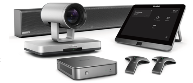
One Cable Technology